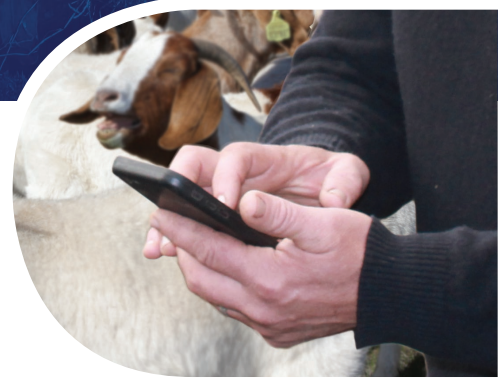
National Vendor Declarations are now available electronically (the eNVD)

The National Livestock Identification System (NLIS) is Australia's system for the identification and traceability of cattle, sheep and goats. The NLIS combines three elements to enable the lifetime traceability of animals: a visual or electronic ear tag, a Property Identification Code (PIC) for identification of physical location, and online database to store and correlate the data. Visit www.nlis.com.au